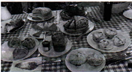
A few recent pictures

First Saturday in the month Coffee Morning 10.00 until midday. Next event - 1 st June